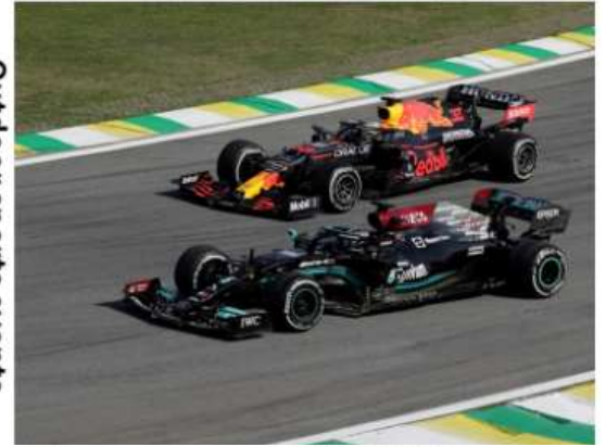
Outdoor sports events