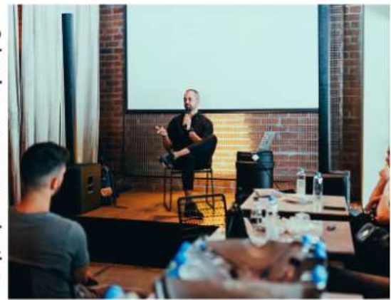
School courseware production