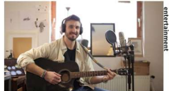
Short video performance entertainment