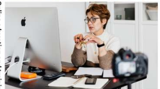
Online education and training