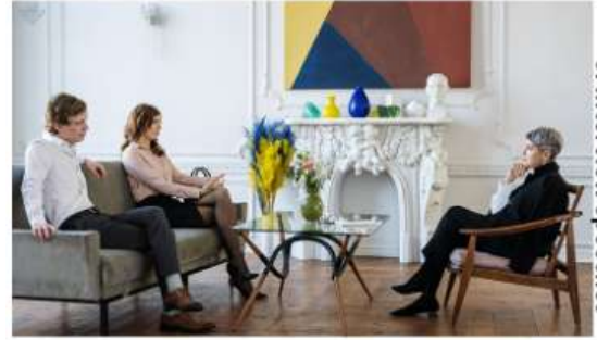
On-site production of interview speeches